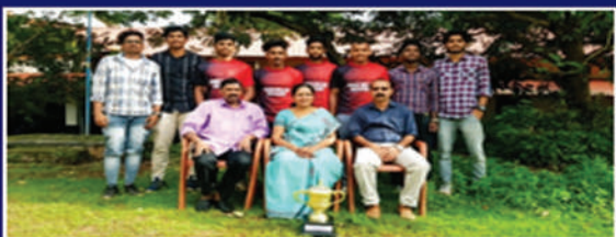
Kannur University Swimming (Men) Runners