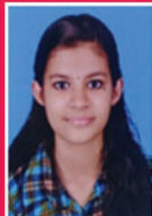
Abhinaya Aksharaslokam - II Prize