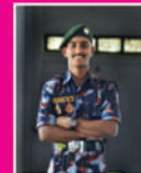
Sanjog PK 2 nd Dc Physics