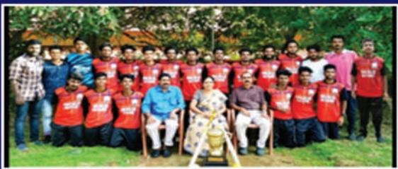
Kannur University Softball (Men) Winners

PRNSS College, Mattanur was the winner of Kannur University Softball (Men) during the year, 2019-2020. Our college won the 'Runners' title in Kannur University Swimming (Men) in the year 2019-2020