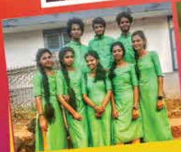
GROUP SONG 3 RD KANNUR UNIVERSITY KALOTSAVAM