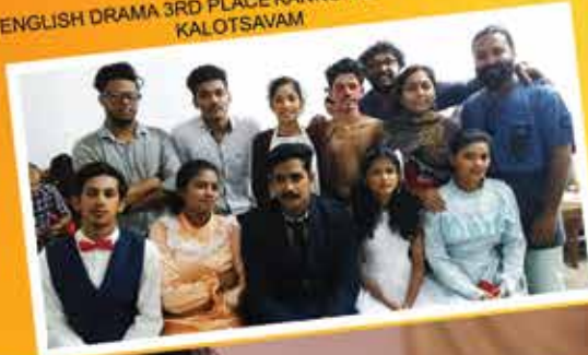
ENGLISH DRAMA 3RD PLACE KANNUR UNIVERSITY KALOTSAVAM